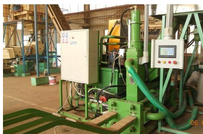
Briquette Press 500

The market includes: North America, Oceania, Southeast Asia, Eastern Europe, Africa (except Middle East), Hong Kong/ Macao/ Taiwan, Latin America, Japan & Korea, Mainland China, Western & Southern Europe, Northern Europe, Central & Southern Asia, Middle East