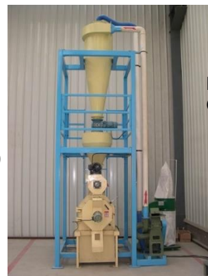
Pellet Testing Line. One available